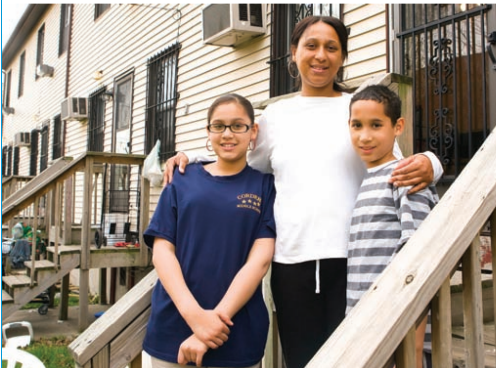
A family in front of St. Jude's transitional housing, Jersey City, NJ