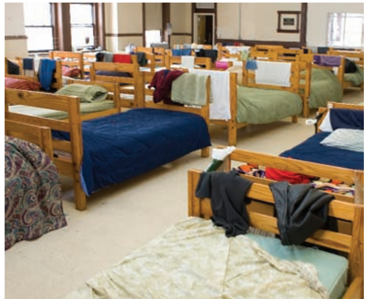
St. Lucy's Emergency Shelter, Jersey City, NJ

Answer: By joining Goodsearch.com , a Yahoo search engine that allows you to give money to Catholic Charities of the Archdiocese of Newark, whenever you do an online search, make a purchase or book a trip. To learn more go to www.Goodsearch.com .